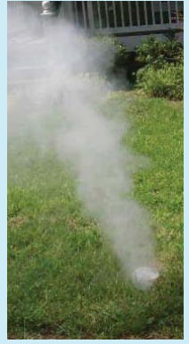
Smoke escaping a broken cleanout cap.