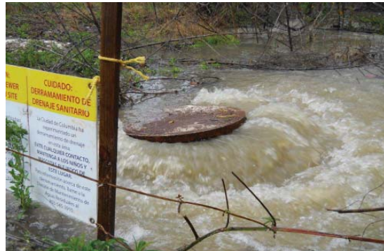
Sanitary sewer overflow in progress.

Stormwater and groundwater do not need to be treated at the wastewater treatment plant. A drainage system to handle extra stormwater or groundwater on your property should follow City regulations.