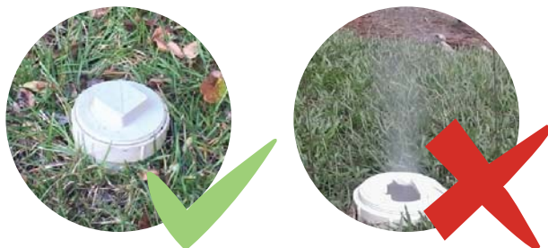
Well-maintained cleanout cap vs. broken cleanout cap (smoke escapes during testing).

Laterals should have a cleanout – a vertical pipe from the underground pipe to the surface with a removable cap for maintenance access.